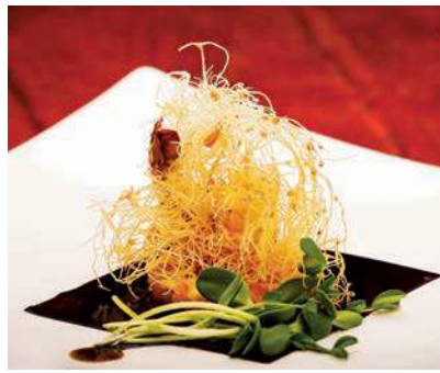
Manuel's Creative Cuisine in San José del Cabo lives up to its name.