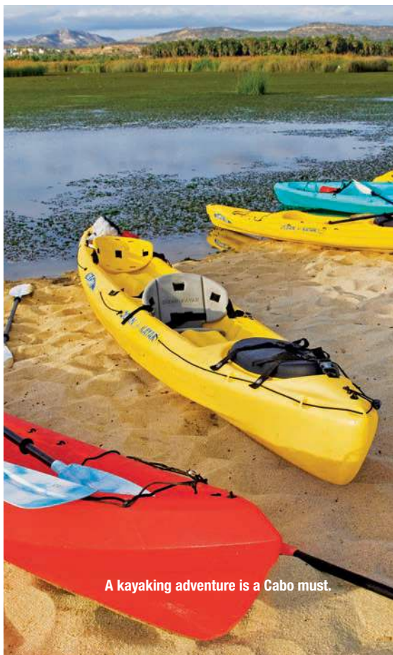
A kayaking adventure is a Cabo must.

MAKE AN EXCHANGE OR PURCHASE A GETAWAY AT INTERVALWORLD.COM.